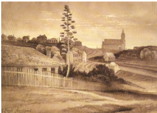
John Kinder, St. Paul's, Auckland . 1856, wash, 252 x 355mm. Hocken Library, Dunedin. (Not in this exhibition).

Although few of these topographical works captured the visual quality and atmosphere of this raw land, the word landscape, "...a painter's word, borrowed from the Dutch in the sixteenth century to mean the pictorial representation of countryside (Pound, pg.23)", refers to the land seen in a pictorial form and so these early 19 th century paintings reflect the artist's hand and their vision of the New Zealand land.